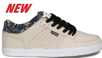
2368 NAT / 420 C / M