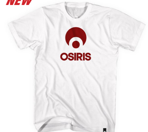
A325 WHT / RED