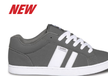
1156 CHR / WHT SN / M