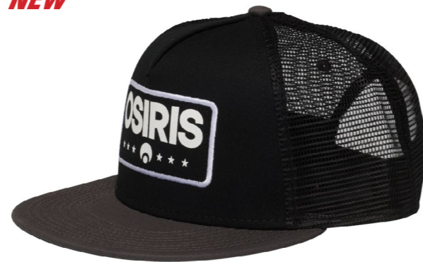
A157 BLK / CHR

BRIGADE BEANIE MB693 100% COTTON ONE SIZE FITS MOST SOLD AS SINGLE