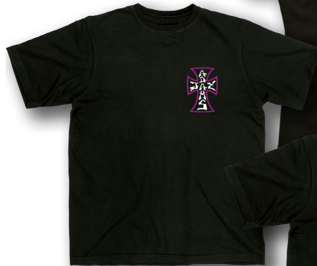
"THE CROSS" BLK / PUR | #MI703-A118 COTTON