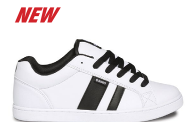
2380 WHT / WHT SL / M