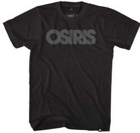
A157 BLK / CHR