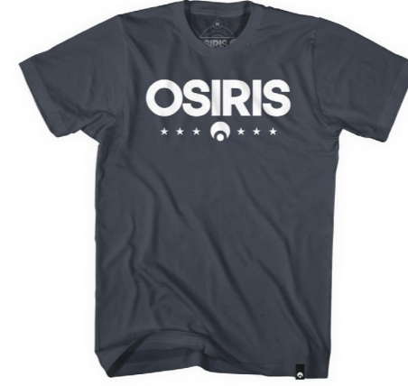
A413 TAR / WHT