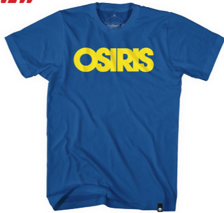
A418 RYL / YEL