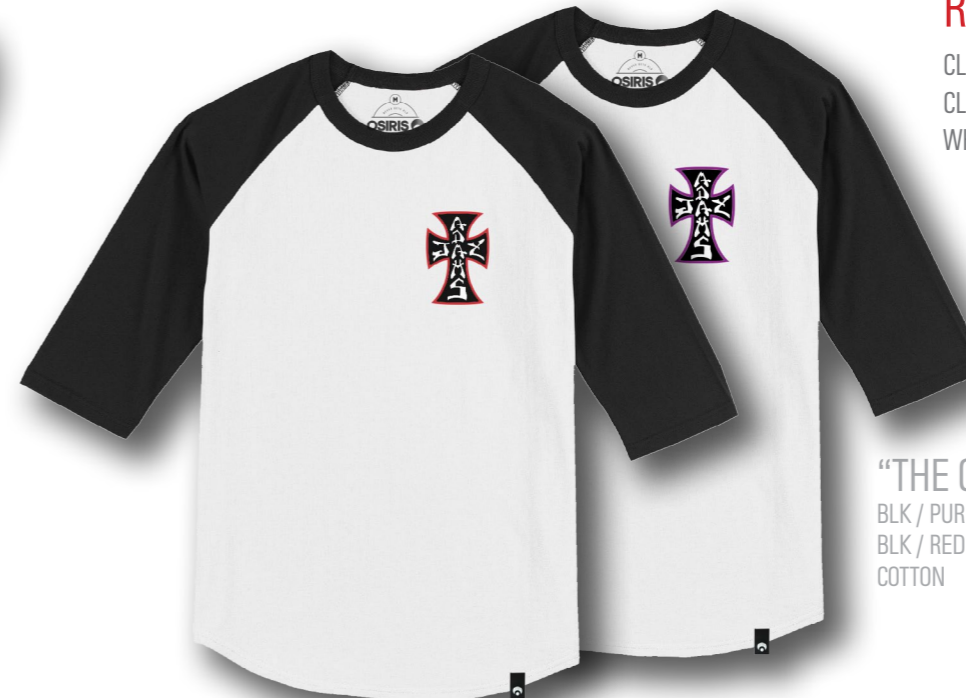
"THE CROSS" BLK / PUR | #MQ703-A163 BLK / RED | #MQ703-A118 COTTON

CLASSIC COTTON RAGLAN'S WITH THE JAY ADAMS CLASSIC CROSS LOGO IN WHITE/BLACK/RED AND WHITE/BLACK/PURPLE. FRONT SCREEN ONLY.