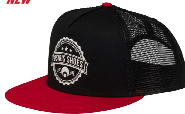
A118 BLK / RED

CLIP BEANIE MB693 100% COTTON ONE SIZE FITS MOST SOLD AS SINGLE