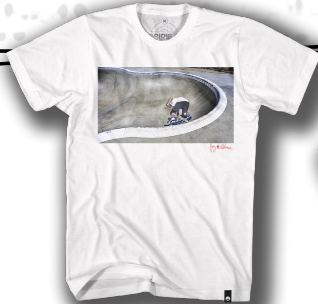
"THE GRIND" BLK | #MI704-A104 COTTON