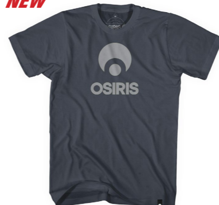
A417 TAR / GRY