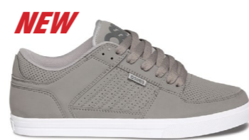
288 GRY / WHT SN / M