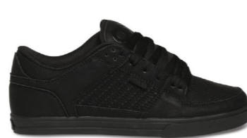
696 BLK SL / M