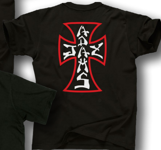
"THE CROSS" BLK / RED | #MI703-A118 COTTON