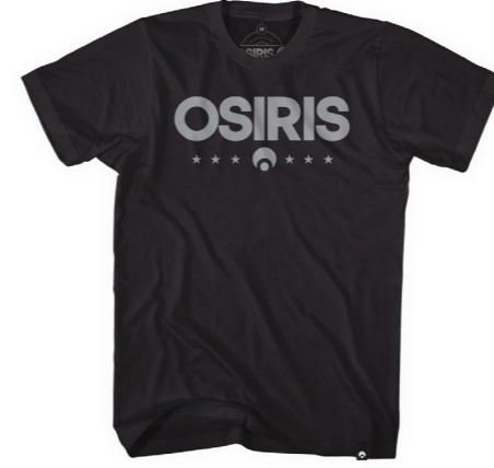
A139 BLK / GRY