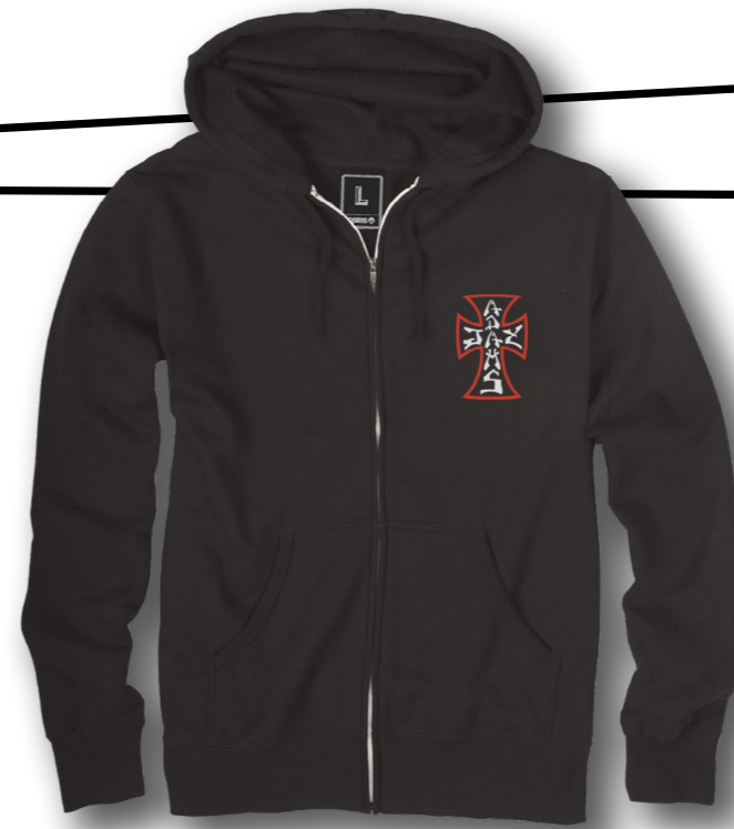
"THE CROSS" BLK / RED | #MK703-A118 COTTON (FRONT SHOWN)