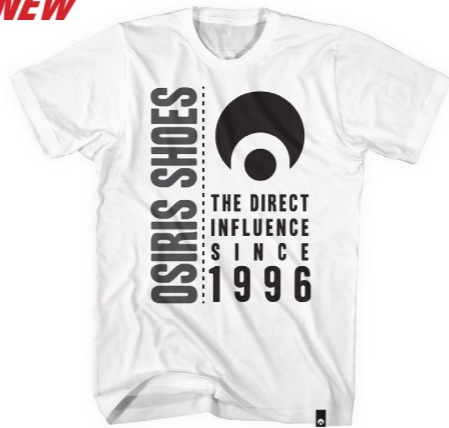
A147 WHT / BLK