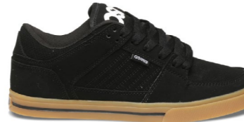
141 BLK / WHT / GUM SN / M