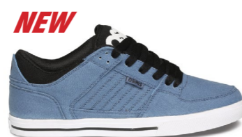
1097 BLU / BLK C / M