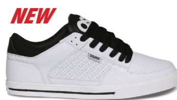
2380 WHT / WHT SL / M