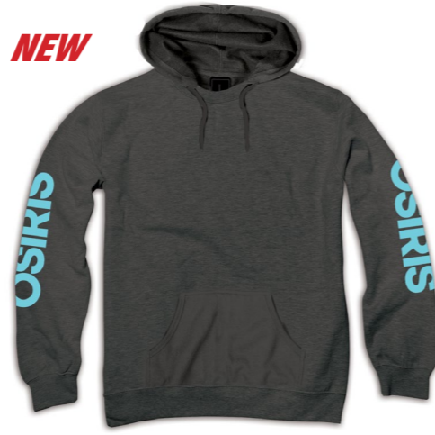
259 CHR / HTR