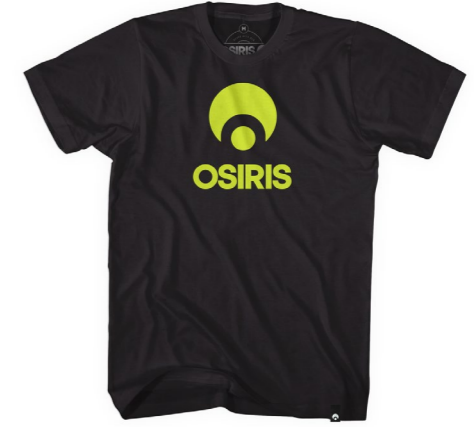
A196 BLK / LME