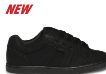
696 BLK SL / M