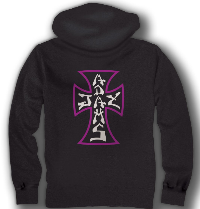
"THE CROSS" BLK / PUR | #MK703-A163 COTTON (BACK SHOWN)