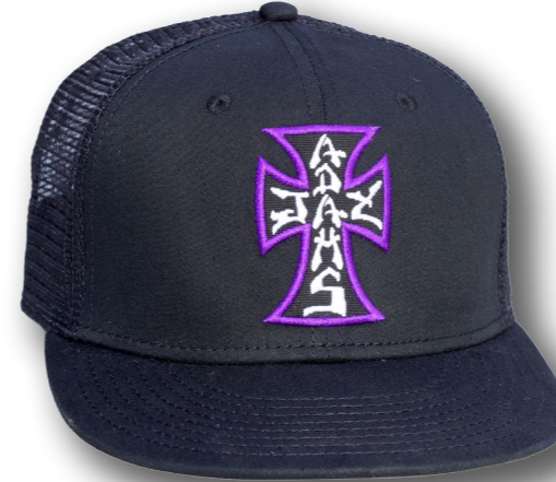
BLK / PUR | #MA703-A163