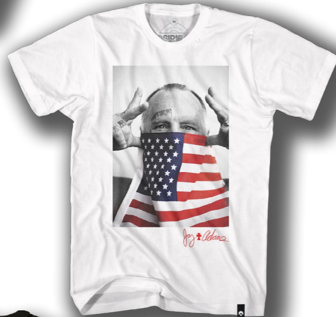
"JAYBOY" BLK | #MI705-A104 COTTON