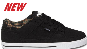
2399 BLK / PLAID C / M