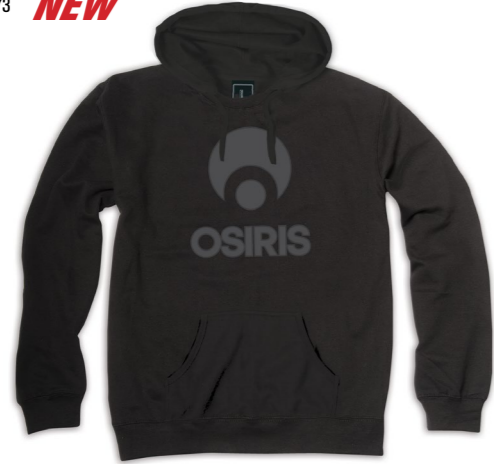
A157 BLK / CHR