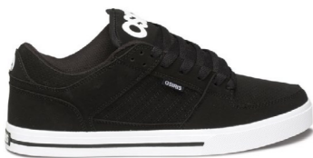
104 BLK / BLK / WHT SN / M