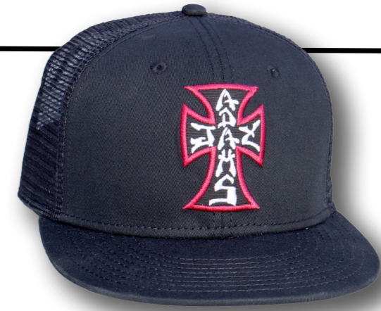
BLK / RED | #MA703-A118